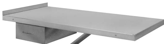
Shown with optional drawer